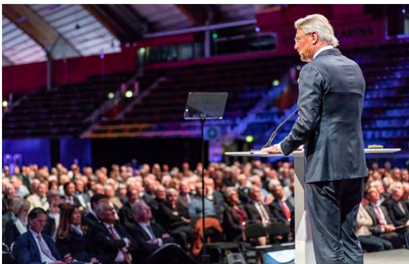
Sandvik's Annual General Meeting 2018 was held at the Göransson Arena, Sandviken, Sweden.